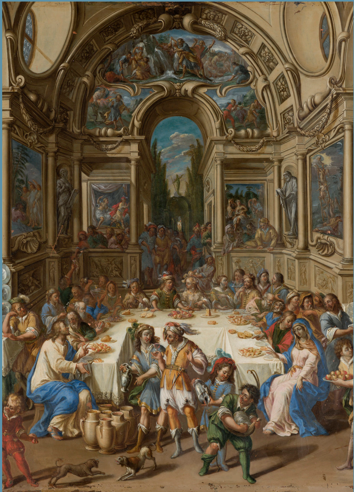
THE MARRIAGE FEAST AT CANA